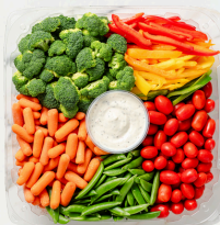
Veggie Crunch 13" tray without dip serves 10-20 $22.49 13" tray gourmet with dip serves 10-20 $27.99 16" tray deluxe veggie with dip serves 30-50 $91.99