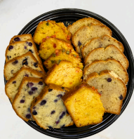
Cake Loaf Collection 1 tray serves 4-5 $17.99