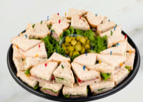
Tea Party Sandwiches 14" tray serves 5–8 $39.99 16" tray serves 8–12 $52.99