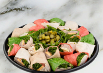
All Wrapped Up 14" tray serves 7–10 $57.99 16" tray serves 10–12 $84.99

FRESH SUSHI ONLY AVAILABLE IN PRINCE ALBERT