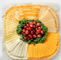
Gourmet Sliced Cheese 14" tray serves 15–20 $54.99 16" tray serves 20–25 $79.99

Fresh, tasteful & best of all – effortless! Prices & offerings are subject to change.