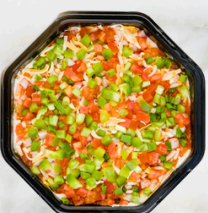
Seafood Surprise Dip $2.49/100g