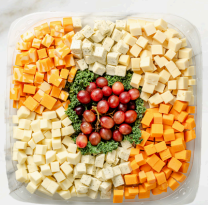
Classic Cheese Bites 14" tray serves 15–20 $64.99 16" tray serves 20–25 $84.99