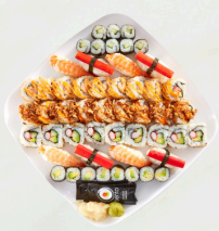
Atsumari Sushi Platter 51 pieces $35.00