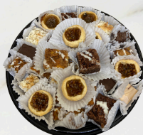
Dainty Delight 11" tray serves 10-12 $25.99 14" tray serves 20-24 $39.99