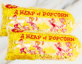
Theatre Popcorn 1 bag serves 10–15 $6.49