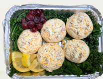
Stuffed Mushrooms 1 tray serves 2-3 $9.99