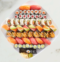
Enkai Sushi Platter 58 pieces $55.00