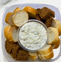
Spinach Dip with Artisan Bread 1 tray serves 4–5 $8.99