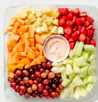
Fruit Feast 13" tray without dip serves 10-20 $29.49 13" tray gourmet with dip serves 10-20 $34.99 16" tray deluxe with dip serves 30-50 $91.99