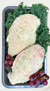
Chicken Cordon Bleu 2 chicken breasts serves 2 $12.00