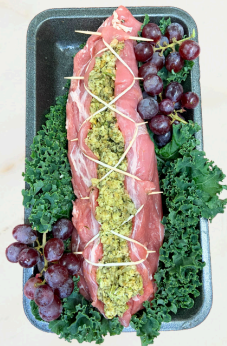
Stuffed Pork Tenderloin 1 loin serves 2-3 $9.99