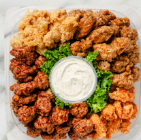
Wing & Chicken Tender Platter 16" tray serves 12–15 $89.99