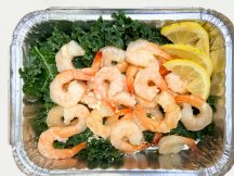
Shrimp Scampi 1 tray serves 2-3 $9.99