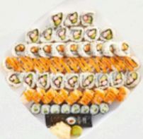
Kazoku Sushi Platter 53 pieces $30.00

FRESH SUSHI ONLY AVAILABLE IN PRINCE ALBERT