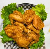
9 Piece Fried Chicken 1 tray serves 4–5 $18.99