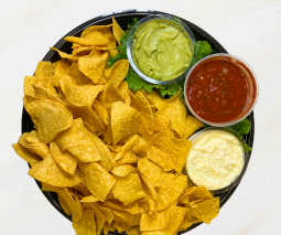
Spinach Dip with Artisan Bread 1 tray serves 5–10 $19.99