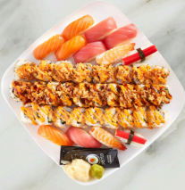
Matsuri Sushi Platter 39 pieces $45.00