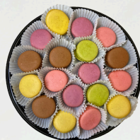
Macaron Medley 1 tray serves 4-5 $29.99