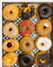
Donut Dozen 12 donuts serves 12 $10.99