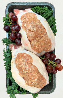
Pork Chop Stuffed with Sausage 2 pork chops serves 2 $9.99