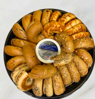
Bagel Bliss 14" tray serves 10-12 $25.99