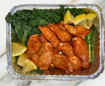
Split Chicken Wings 1 tray serves 1-2 $9.99