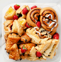
Pastry Perfection 11" tray serves 8-12 $19.99 14" tray serves 20-24 $29.99