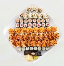
Utage Sushi Platter 60 pieces $50.00