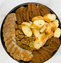
Artisan Bread 1 tray serves 10–12 $19.99