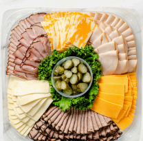
Classic Meat and Cheese 14" tray serves 15–20 $69.99 16" tray serves 20–25 $84.99