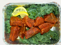
Beef Steak Bites 1 tray serves 2 $12.00