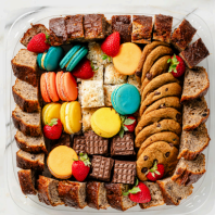
Sweet Treats 11" tray serves 8-12 $29.99 14" tray serves 20-24 $57.99