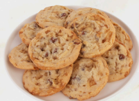
Cookie Lover's 11" tray serves 5-10 $21.99 14" tray serves 15-20 $37.99