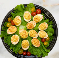
Deviled Eggs 1 tray serves 4–5 $7.99